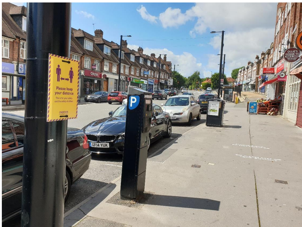
Selsdon High Street on the Northern side looking West towards Sainsbury's