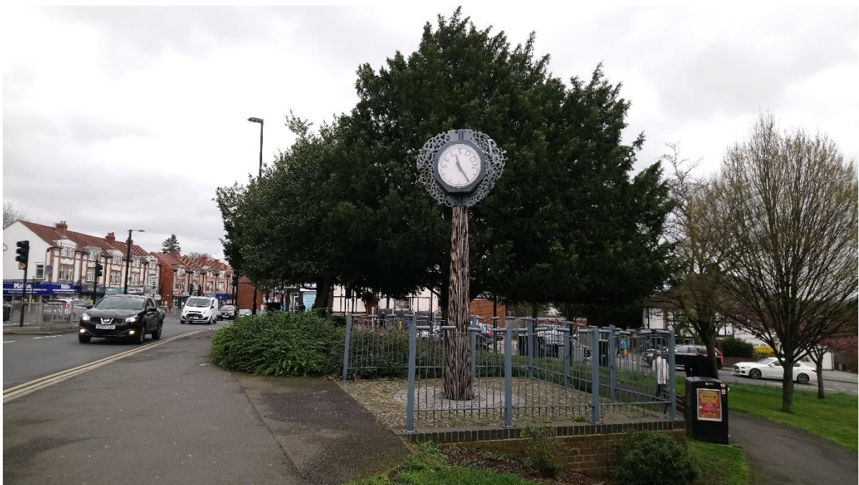
Selsdon clock outside Sainsbury's looking East, showing proximity to the High Street