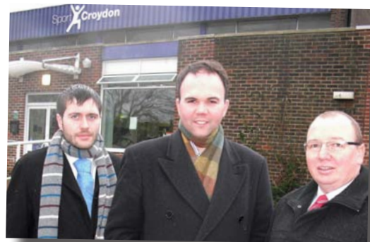
Right: A key priority for the team is to push forward the regeneration of Central Parade, stalled by the Village Green lobby, and to ensure that the pool and other facilities are kept in good order until the new development can start. Here the team discuss the development with Gavin Barwell.