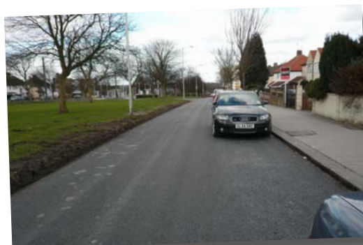
Left: If elected we will continue to press for New Addington's damaged roads to be resurfaced, as was done to this stretch of Parkway at our insistence.